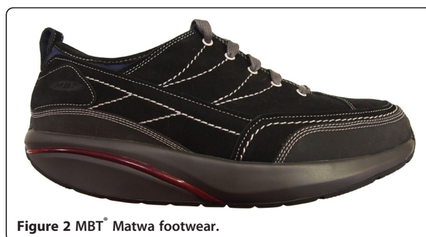
Figure 2 MBT® Matwa footwear.

The prefabricated foot orthoses group will receive a pair of foot orthoses (Vasyli Customs – medium density, Vasyli Medical, Queensland, Australia) that will be