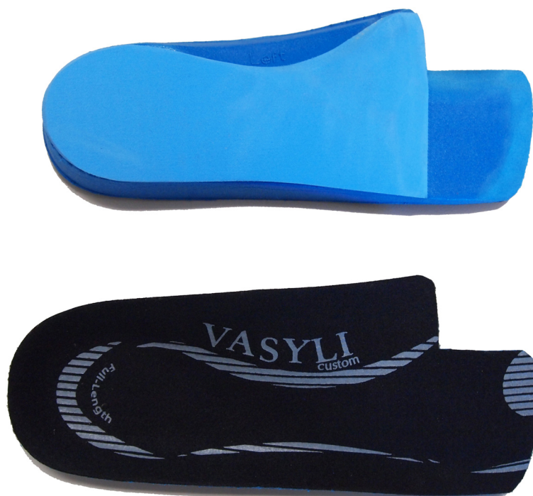
Figure 3 Prefabricated foot orthoses to be used in the trial. Top: plantar surface of left foot orthosis. Bottom: dorsal surface of right foot orthosis.